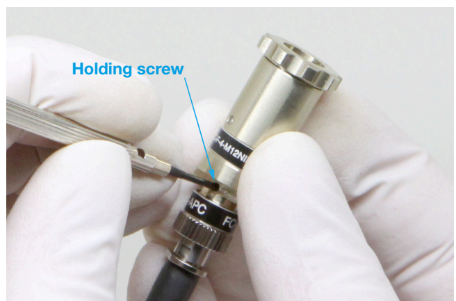
Figure 1 right: Fixing the fiber ferrule