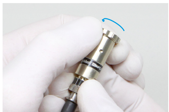
Figure 2 right: Slightly rotate eccentric key